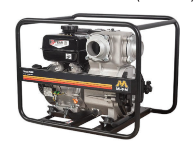
3IN TRASH PUMP WTP-T03-0MGM (160215)