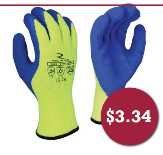
RADIANS WINTER PROTECTION CUT 3 GLOVE

M (628315) RWG27M L (628316) RWG27L XL (628317) RWG27XL