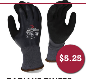
RADIANS RWG28 WINTER CUT 2 WATERPROOF GLOVE

M (628315) RWG27M L (628316) RWG27L XL (628317) RWG27XL