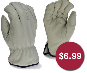
RADIANS PREMIUM COWHIDE LEATHER INSULATED DRIVER GLOVE

M (638143) L (638140) XL (638141) 2XL (638142) 3XL (638144) 4XL (638145) 5XL (638146)