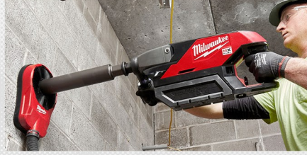
MX FUEL™ HANDHELD CORE DRILL MXF301-1CP 569050