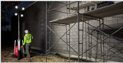
MX FUEL™ TOWER LIGHT CHARGER MXF041-1XC 598090