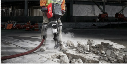
MX FUEL™ BREAKER MXF368-1XC 600023