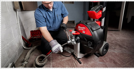
MX FUEL™ SEWER DRUM MACHINE W/ POWERREDZ™ MXF501-1CP