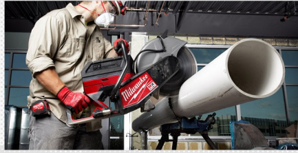
MX FUEL™ 14" CUT-OFF SAW MXF314-1XC 169057