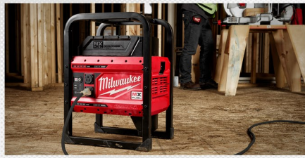
MX FUEL™ CARRY ON POWER SUPPLY MXF002